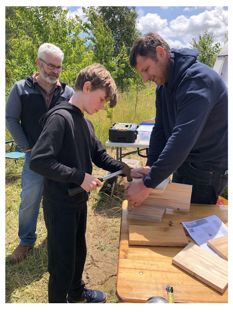
(top left & above Bird & Bat Boxes; bottom left Stargazer Chairs)