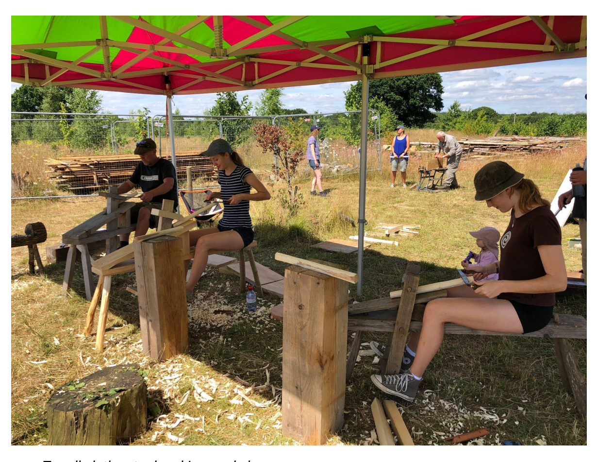
Treadle lathe stool making workshop